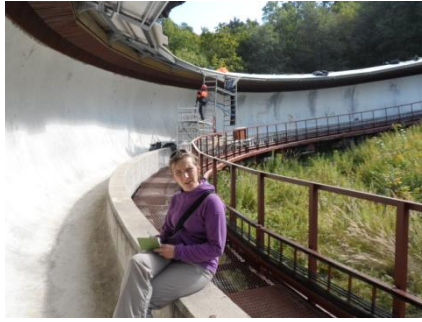
Picture Nr. 12 Curve 16, next to the VIP tent.

How to get here: From the finish hill side, along the track, at the bottom of the track (the straight line) after curve 15, next to the VIP tent.